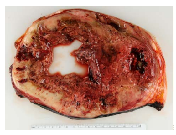
Figure 4 . Gross photograph of the resected breast mass. This is a well-circumscribed mass, which essentially replaces the breast. The cut surface shows necrosis, hemorrhage, and cystic degeneration.