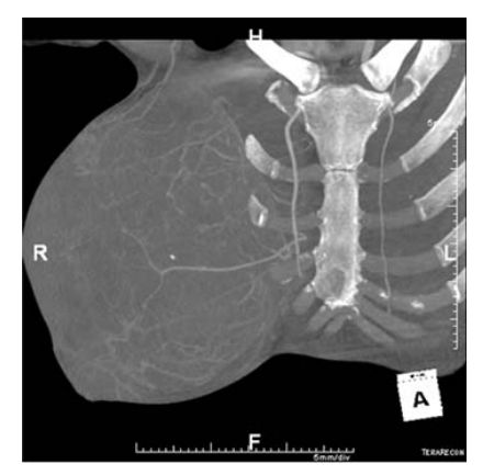
Figure 3 . Computed tomography angiography image of the chest demonstrates large moderately enhancing right breast mass with extensive vascularity.