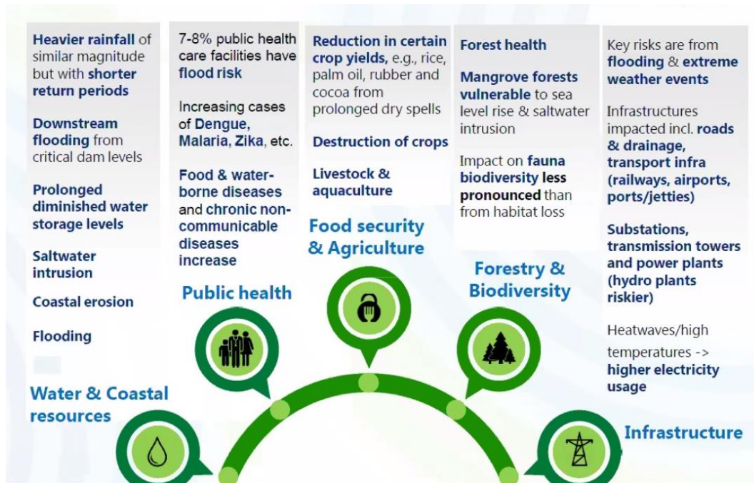
Figure 2. Key risks of infrastructure are from flooding.