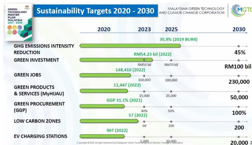
Figure 4. Sustainability Targets 2020-2030.

Source: Malaysia Green Technology and Climate Change Corporation