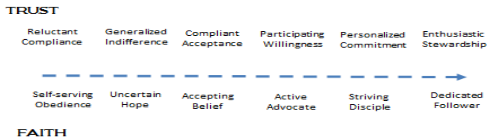
Figure 3. Trust & Faith Compliance/Commitment Continuum