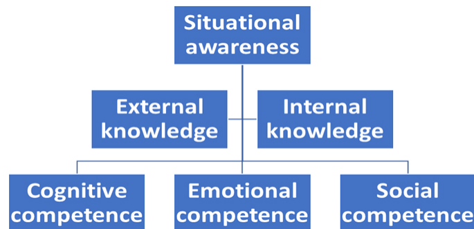
Figure 2. Situational awareness according to the study participants

This chapter first presents the findings regarding the first research question, What does emergency care providers' situational awareness involve in the identification of abuse? Based on the analysis of the interviews, situational awareness appeared to consist of cognitive competence (logical reasoning and detection of cause-effect relationships); emotional competence (empathy and emotional intelligence); social competence (interaction skills and assessment of family dynamics), and experiential knowledge. The latter part of the results deals with emergency care providers' responses to the second research question: What observations lead emergency care providers to suspect abuse? The analysis yielded the following categories: The overall situation; the client's physical condition; the client's mental condition; the context and circumstances, and the logic in client reports. Direct quotations are provided, with the interviewees coded P1-P12. The results of this study have been summarized in Figure 2.