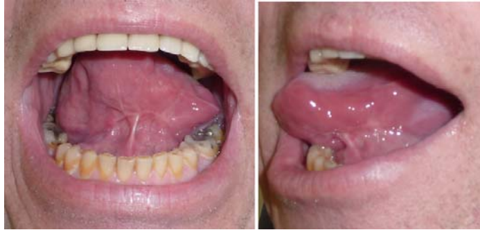
Figure 3. Patient showing total remission with minimal scar-tissue formation

rheumatologist noted, after reviewing the case that the clinical information and the pathology report were not typical of vasculitis. At the final follow-up appointment in our outpatient clinic, the tongue showed total remission and the patient had no complaints, even though some scar tissue had formed (see Figure 3). In order to rule out vasculitis, the pathologist subsequently reexamined the biopsies. The tissue was stained with Elastin-Van Giesum to identify vessels but unfortunately the vessels represented in the biopsies were too small to confirm, or to rule out temporal arteritis.