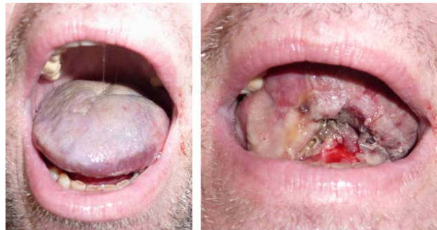
Figure 1. A swollen and discolored tongue, with a necrotic lesion along the inferior part of the tongue.

A 57-year old Caucasian male, with a history of alcohol abuse and heavy smoking, was admitted to our department of otorhinolaryngology with a painful, swollen and discolored tongue. He had severe difficulties in swallowing and with articulation. The patient was unable to account for the duration of the symptoms but denied any prior trauma or signs of infection. The clinical examination revealed a foul smelling necrotic lesion, measuring 3 cm across the inferior aspect of the tongue (see Figure 1). The lesion, and the anterior part of the floor of the mouth, felt firm on palpation, but sensitivity on the tip of the tongue seemed normal. Fresh bleeding occurred when the mucosa was punctured with a thin needle. The remaining clinical examination was normal; in particular the patient was afebrile and had a normal blood pressure, normal vision and displayed no headache or other neurological or rheumatic symptoms. Due to previous alcohol abuse the patient was taking vitamin B and Antabus ® (disulfiram) at the time of admission. Given the patient's history of tobacco and alcohol abuse, cancer was highly suspected with a possible secondary infection. The initial blood analyses showed signs of infection (C-reactive protein: 114 mg/L [normal value < 8.0 mg/L], white blood cell count 11.9 \times 10^9/L [normal range 3.5-8.8 \times 10^9/L ]) and the patient was treated with intra venous metronidazole and cefuroxime.