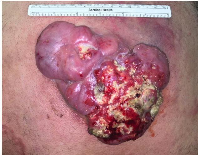
Figure 1. This image shows the 13.7 cm × 3.3 cm × 10.9 cm fungating lesion, which was noted to be draining pus, blood and serous fluid on physical exam

a later time. The wound was dressed with Daikin's solution soaked kerlex to prevent infection, and the patient received TID dressing changes for the first 3 days post-operatively. A wound vacuum was then placed and 11 days following the initial procedure the wound was eventually closed using split thickness skin grafts taken from each thigh.