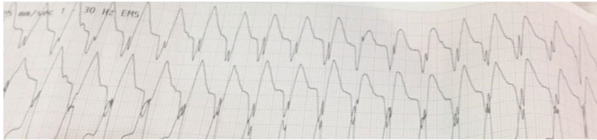
Figure 1. Electrocardiogram recorded by Emergency Medical Services showing Monomorphic Ventricular Tachycardia

performed bedside, which showed mildly dilated left atrium and left ventricle with reduced left ventricular ejection fraction (see Figure 3). She was overdrive paced for a day. On telemonitoring, she was found to be in sinus rhythm with PVC. IV Amiodarone was also given to control ventricular arrhythmias.