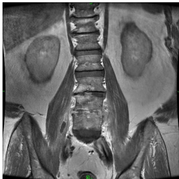
Figure 3. MRI, contrast enhanced T1 weighted image, coronal plane: smaller psoas abscess on the right side

Search for the origin of the infection was continued, urine and throat culture proved to be negative. Oral surgical referral and intervention was made due to spontaneous tooth extraction, but neither wound discharge, nor other focus of infection was found. Blood culture revealed Staphylococcus aureus positivity and ceftriaxone was added to clindamycin in his intravenous treatment regimen. The patient's CRP gradually normalised, he remained afebrile and the paresthesia on the dorsum of his foot slowly diminished. He mobilised with Boston corset and he was discharged in good general condition after a four-week course of intravenous antibiotic therapy. He continued with oral clindamycin for another four weeks at home and he is currently being followed up at the outpatient clinic.