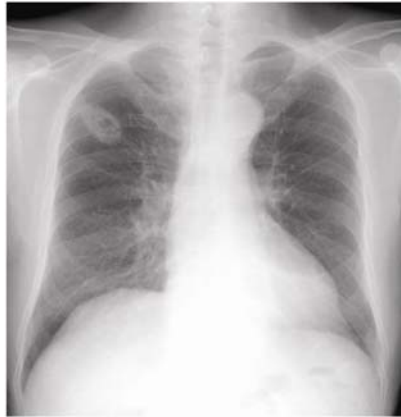
Figure 1. Chest radiograph taken on admission. Consolidation and a cavity are evident in the right upper area.

(9,500 / \mu L). All tests for (1-3) \beta -D glucan, serum Aspergillus antigen, serum cryptococcus antigen, c-ANCA, and tumor markers were negative.