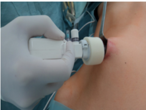
Figure 4. Introduction of blunt trocar while maintaining elevation