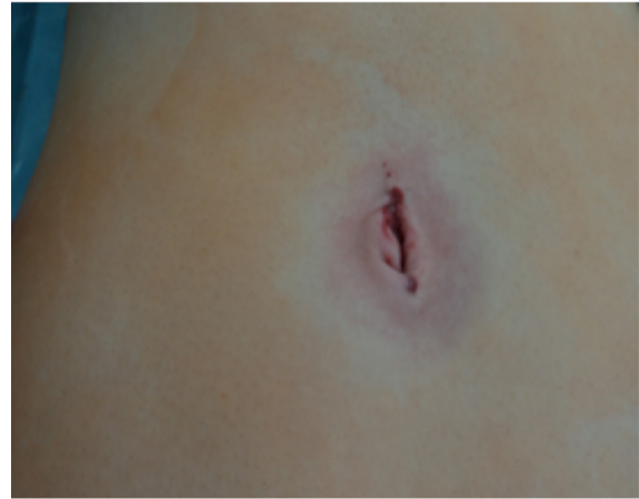
Figure 5. Surgical wound is irrigated with saline solution and closed with a subcuticular Monocryl 4-0 suture