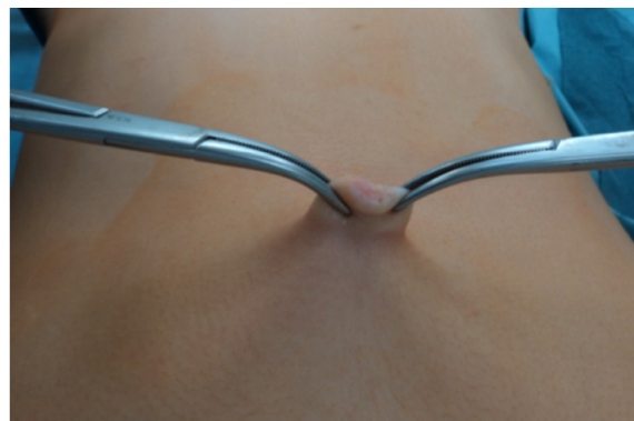
Figure 1. Elevation of the umbilicus with Kelly clamps