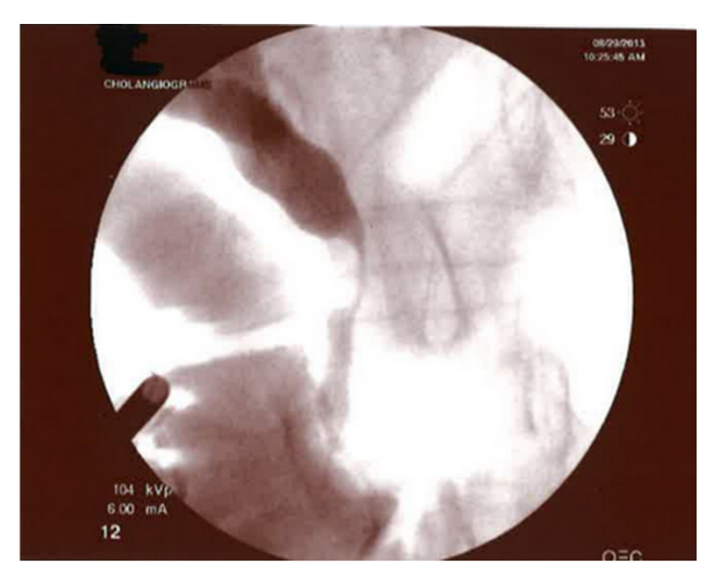
Figure 2. Cholangiogram obtained during cholecystectomy showing prominent common hepatic ductal obstruction

the mass. The pathology (see Figure 4), showed classic noncaseating granulomatous disease consistent with sarcoidosis. There were no malignant cells identified. Specimens were negative for acid fast bacilli (AFB) and fungal organisms.