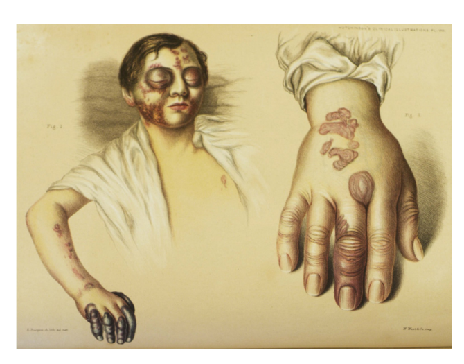
Figure 1. Original depiction of cutaneous form of sarcoidosis in " Illustrations from Clinical Surgery " by Jonathan Hutchinson<sup>[3]</sup>

epigastric abdominal tenderness. Initial laboratory values showed an elevated alkaline phosphatase of 249 U/L (normal 37-125 U/L), and a normal total bilirubin and transaminases. Abdominal ultrasound showed gallbladder wall thickening, intra and extrahepatic bile duct enlargement, with a common bile duct (CBD) measuring 1.5 cm. A computed tomography (CT) abdomen confirmed intra and extrahepatic ductal dilation but was otherwise unremarkable. CA 19-9 was drawn and elevated at 148.8 U/ml (0-37 U/ml normal). Serum angiotensin converting enzyme (SACE) was normal at 47 (8-52 normal). A CT of the chest was normal.