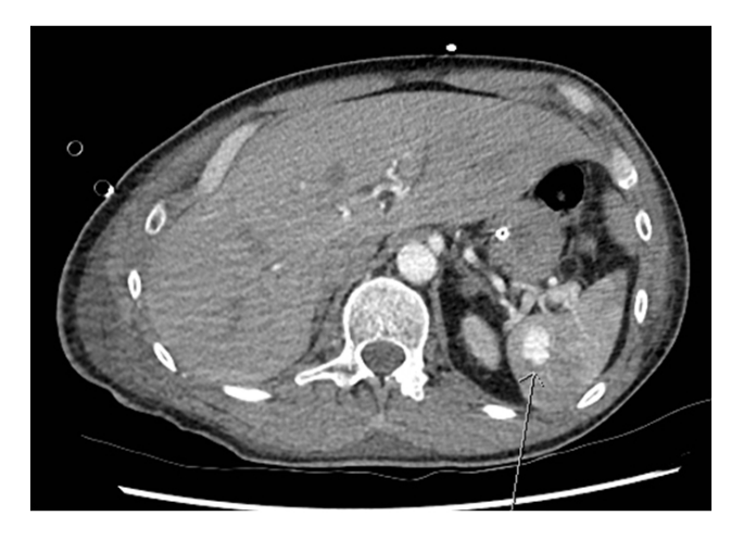
Figure 2. Computerised tomography, arterial phase on day 6 of admission

Arrow depicting a new 2 cm hyperdense focus in the region of the splenic hilum, suspicious for a pseudoaneurysm