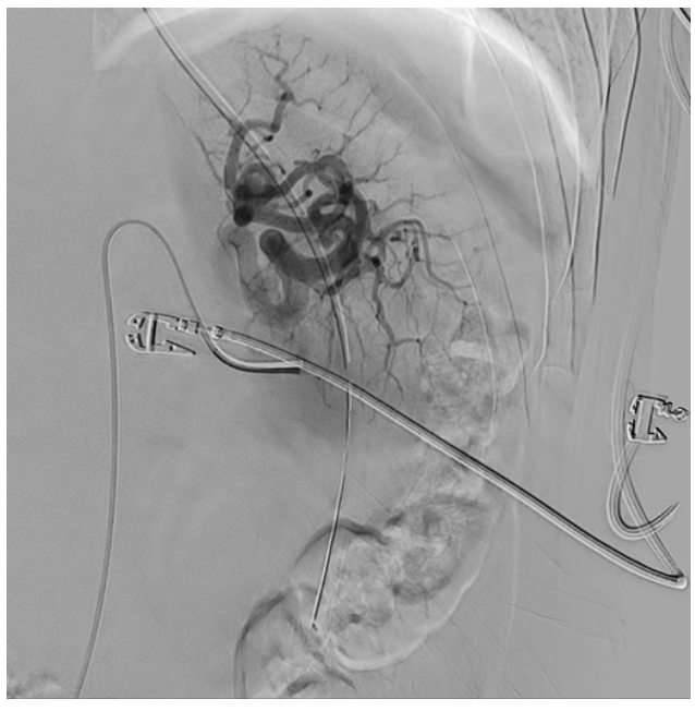
Figure 3. Angiogram depicting the splenic pseudoaneurysm of the upper pole branch of the splenic artery

hyperdense focus was found in the splenic hilum (see Figure 2) which was not present on his initial trauma scan. Even though his initial abdominal examination and investigations were normal the trauma was significant enough to be concerned about splenic injury consistent with a splenic artery pseudoaneurysm.