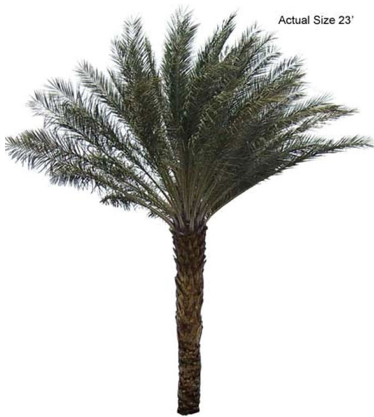
Figure 1. Sylvester Palm Tree

Figure 3). Decompression was achieved with a 22 French left chest tube thoracotomy placed in the left mid-axillary 5th intercostal space (see Figure 4). The patient was then admitted to the trauma service where he recovered with complications. The chest tube was discontinued on hospital day #4 and the patient was discharged to home on hospital day #5. Follow up evaluation in clinic demonstrated complete resolution of symptoms and no evidence of recurrent pneumothorax.