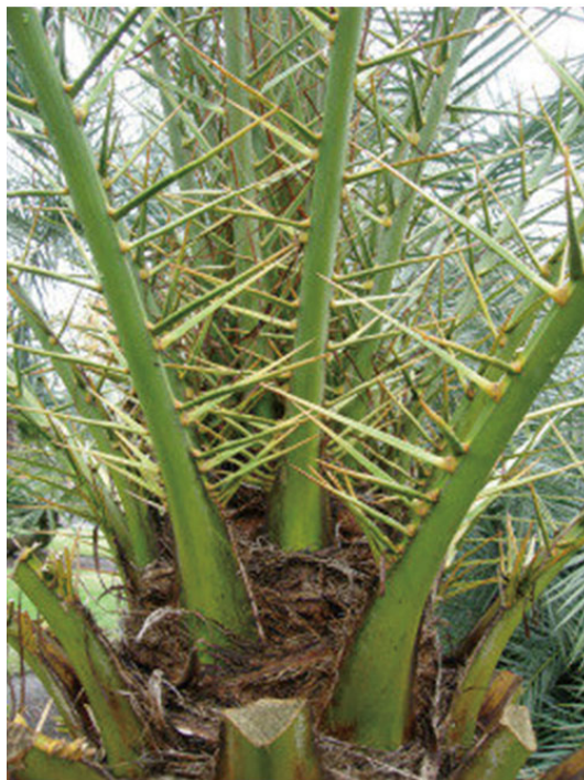
Figure 2. Sylvester Palm Fronds with Thorns