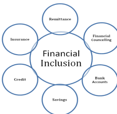
Figure 1. Essential Contents of Inclusive Financing

It is about the delivery of banking services such as savings, credit, insurance, payment, and pension, at an affordable cost to vast sections of the economy, especially the low-income segment or disadvantaged sectors (Ahmed, 2006) as presented in Figure 1. (Martinez, 2011) identified financial access as an important policy tool employed by the government in fighting and stimulating growth given its ability to facilitate efficient allocation of productive resources, thus reducing the cost of capital. Financial inclusion is a concept that portrays the state in which all people have access to appropriate, desired financial products and services in order to manage their money effectively (Leyshon & Thrift, 1995). Financial inclusion according to (Adunda & Kalunda, 2012) is the process of availing an array of required financial services at fair price, at the right place, form, and time without any form of discrimination to all members of the society.