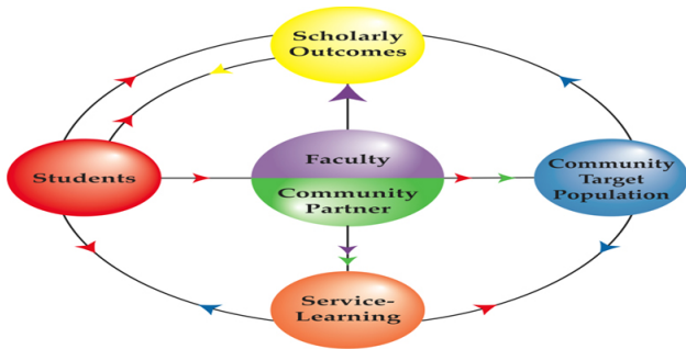
Figure 1. The partnership model for service-learning

The Partnership Model for Service-Learning was successful in guiding and implementing comparable projects. [17] The results of comparable programs showed positive outcomes for faculty members, students, community partners and community members. The model helped the programs in planning and in setting expectations and responsibilities. [17,18]