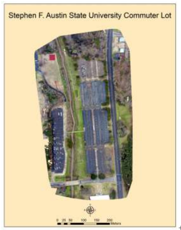
Figure 1. Study site depicting the Commuter Parking Lot on the SFASU Campus.

The SFASU Commuter Parking Lot (Figure 1) was chosen as the study site due to the proximity and accessibility to SFASU students and faculty and its clearly defined lines that have not changed between the times the aerial imagery, imagery with the drone, and measurements with a tape measure were taken.