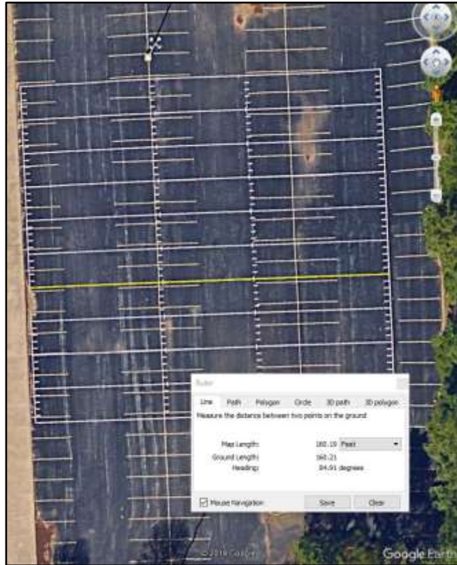
Figure 4. Example of estimating linear feature length within the Google Earth Pro interface.