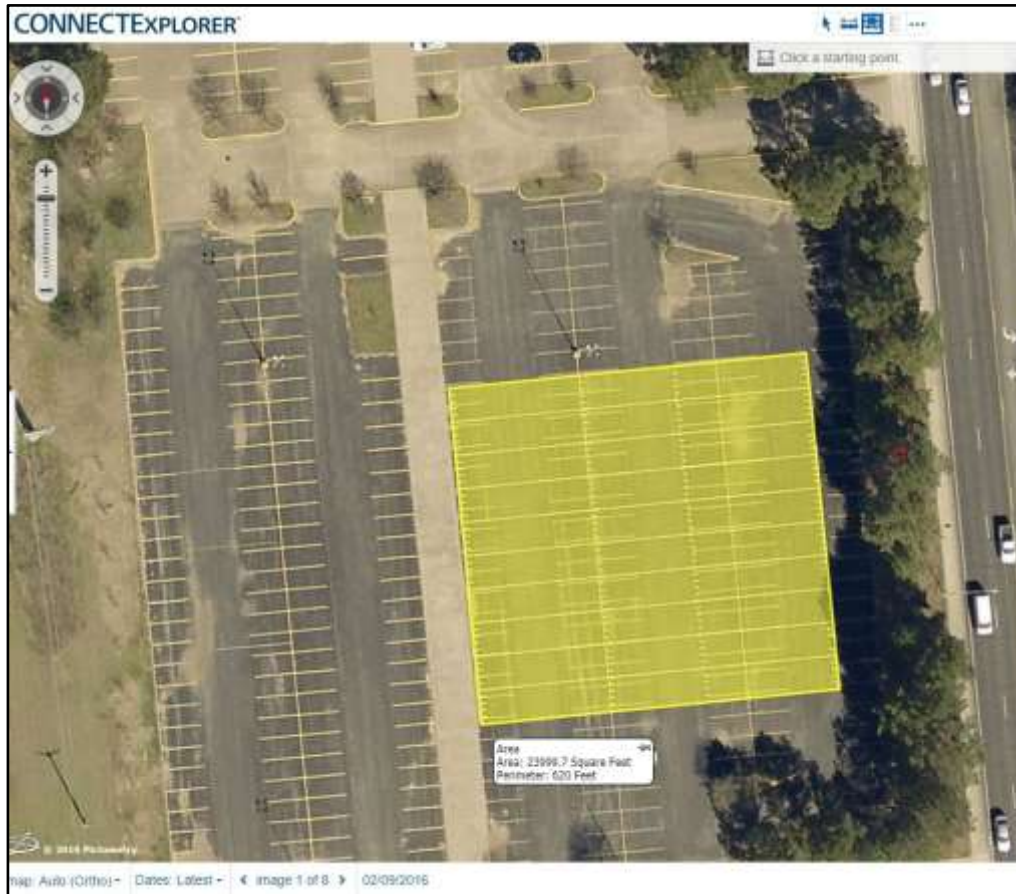
Figure 3. Example of estimating feature area within the Pictometry web-based interface.

Google Earth Pro software is available to all students through the ATCOFA GIS Laboratories. The forestry student was instructed how to measure the linear distances and areas of surface features remotely using Google Earth Pro 7.1.8.3036 (32-bit) developed by Google Inc. (Mountain View, California). Imagery data taken November 2015 was chosen as this was the most recent imagery data displayed for Nacogdoches, Texas. Once the student learned how to measure linear distances and areas within the Google Earth Pro interface, the student was allowed to record measurements himself (Figures 4 & 5).