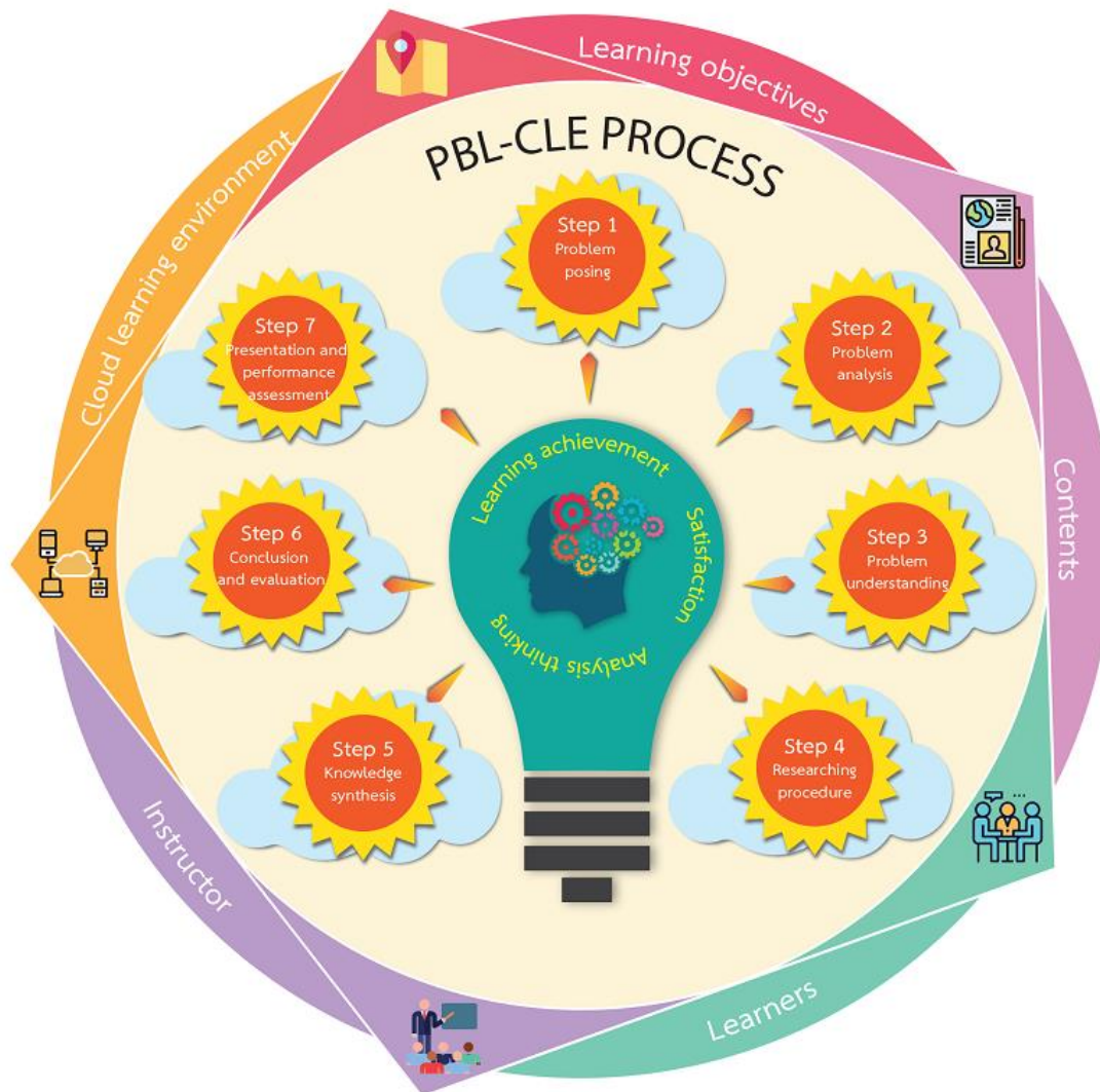
Figure 2. The PBL-CLE process to enhance analysis thinking

Figure 2 presents four elements of the development process of the PBL-CLE process to enhance analysis thinking as follows: