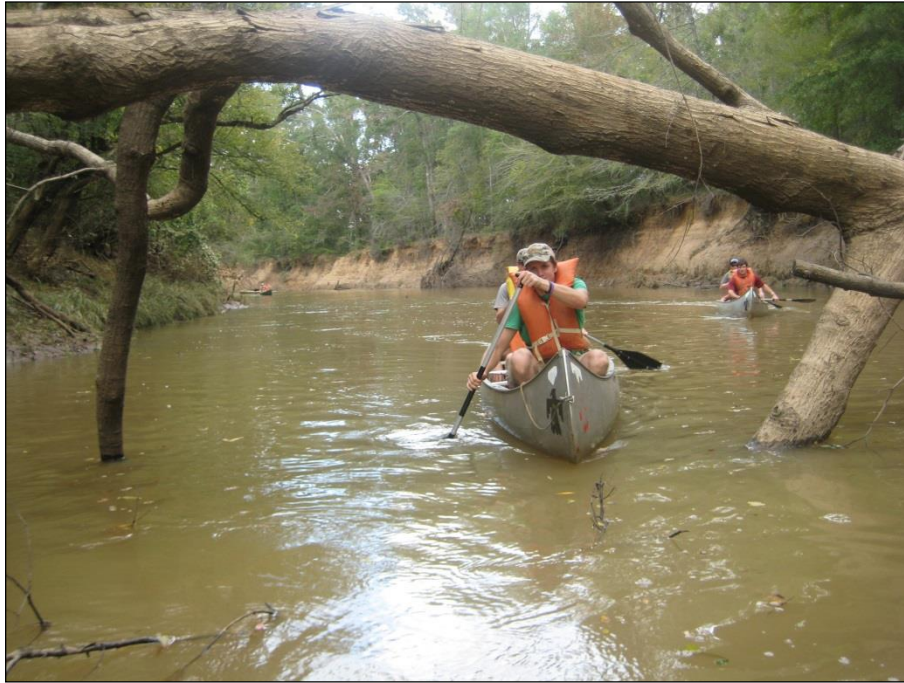
Figure 3. Collaborative teamwork is required for students to complete the Neches River exercise. By the end of the three-hour trip, students develop comradery, a sense of accomplishing an important task, and a connection to the natural resource and profession.