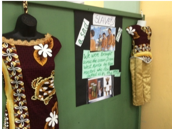
Figure 3. Writing activity around the theme "My Country: My Past"

Figure 3 illustrates a writing center activity using one of Trinidad and Tobago's local calypso as the catalyst.