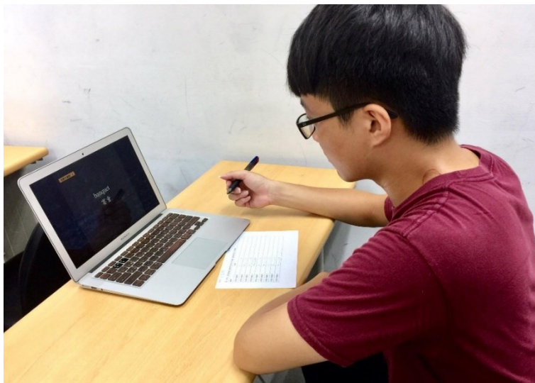
Figure 1. Experiment Scenes

Another aim of the experiment was to investigate if personal feeling had an effect on memorization performance. Subjective scoring was conducted to assess the criteria “visibility,” “visual comfort,” and “satisfaction” of three color matching combinations (contrast of hue, contrast of value, and contrast of chroma) by the examinees’ giving scores to each criterion. In the study, visibility referred to a measure of how well an examinee could discriminate a word or symbol from the background, visual comfort referred to a measure of how comfortable an examinee felt or looked at a combination at that moment, and satisfaction referred to a measure of personal preference for a combination. The examinees wrote down their preferred hue, value, and chroma. Among the attributes, the selection of hue was based on Johannes Itten’s 12-hue color circle (Johannes, 1973).