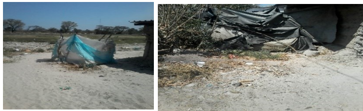
Figure 3. Structure for Bathing in One Informal Settlement

The dumping site shown above is close to dwellings. This is evident from the fact that at the background, some dwellings are observed under the tree and beyond. However, these dwellings are so close to the dumping site. It has been pointed out in the literature that these residents do not have proper sanitary system. Figure 3 below shows a structure used for bathing purposes and also for helping one, when nature calls.