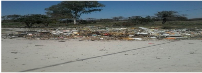
Figure 2. A Dumping Site in an Informal Settlement

The dumping site shown above is close to dwellings. This is evident from the fact that at the background, some dwellings are observed under the tree and beyond. However, these dwellings are so close to the dumping site. It has been pointed out in the literature that these residents do not have proper sanitary system. Figure 3 below shows a structure used for bathing purposes and also for helping one, when nature calls.