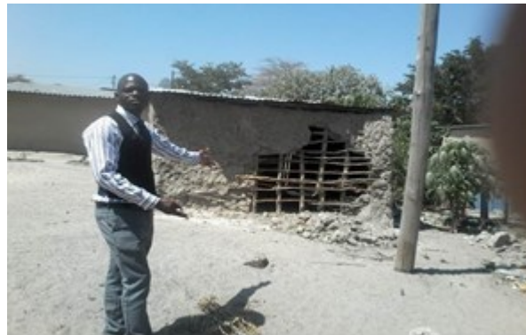
Figure 1. A Dwelling Structure Found in One of the Informal Settlements

The data which is presented below came as a result of using the observation instrument. The researchers moved around the area where the informal settlements are located. This data from observation is presented below. In Figure 1, a structure of an informal settlement facility is shown.