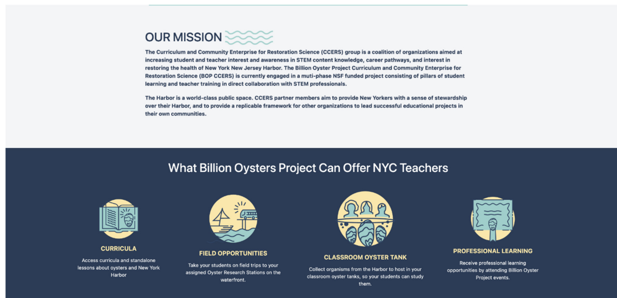
Figure 1. Our Mission

The BOP-CCERS Digital Platform, https://bopuiprod.azurewebsites.net/home , serves as a repository of data, research, materials, and resources generated by the support provided by the National Science Foundation in NSF EHR DRL Grants 1839656 and 1759006/Principal Investigator, Dr. Lauren Birney. The mission is to provide information on a global scale to stimulate networks and communities in Environmental Restoration Science to connect and communicate with one another, as shown in Figure 1.