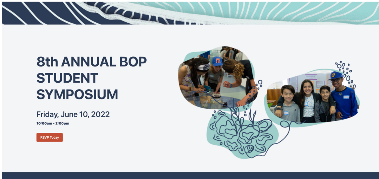
Figure 3. 8th Annual BOP Student Symposium

Events, Colloquia, Symposia, and activities also provide opportunities for connectivity, accessibility and networking globally among related communities (see Figure 3).