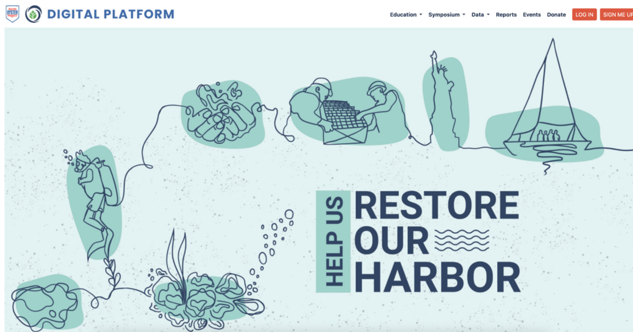
Figure 6. Help Us Restore Our Harbor