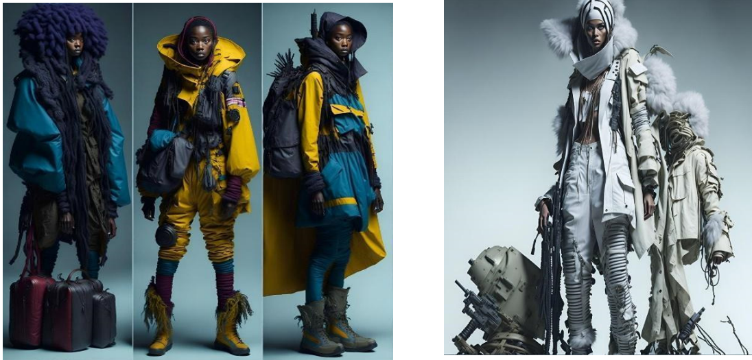
Figure 3. Post-apocalyptic Fashion

Thus, Figure 3 shows the results of the AI-assisted figure proportioning exercise (post-apocalyptic fashion). This exercise allows design and art students to experiment with creating images that reflect the aesthetics of a post-apocalyptic world. AI is used to visualise and simulate the design, providing students with an interactive approach to the creative process and deepening their virtual fashion exploration. Figure 4 highlights the vision of ethnic style based on the use of neural networks.