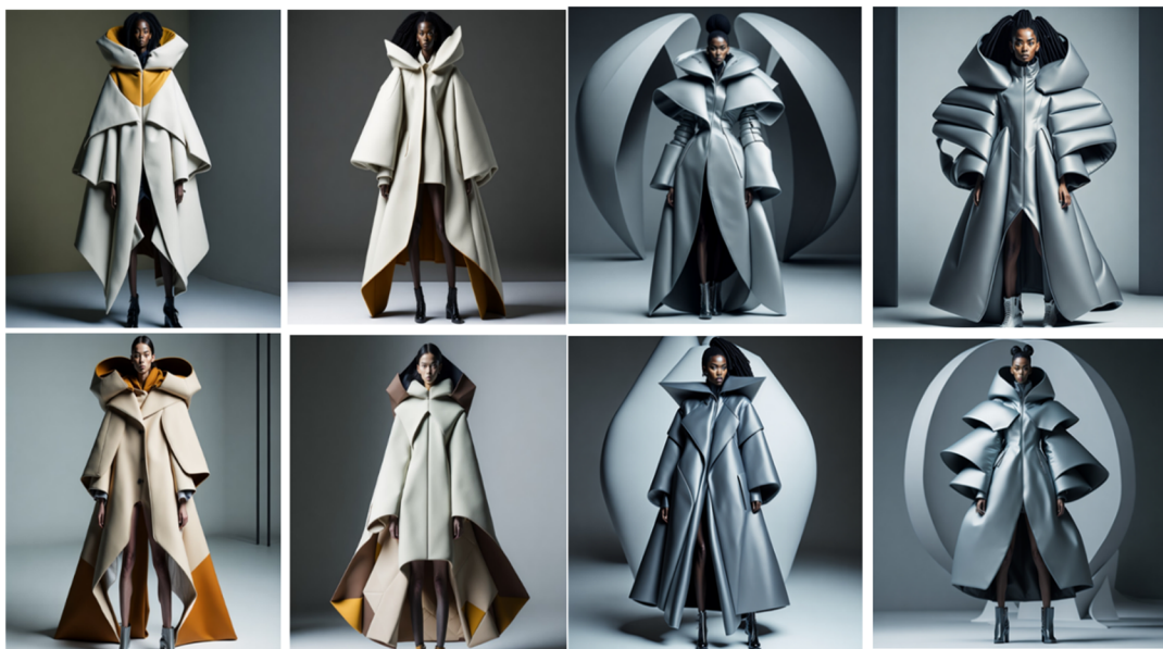
Figure 2. Futuristic Fashion