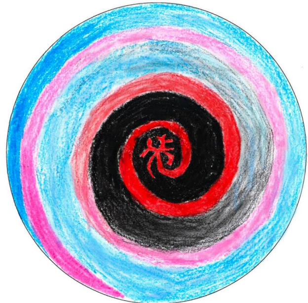
Figure 9. A golf-ball sized lump