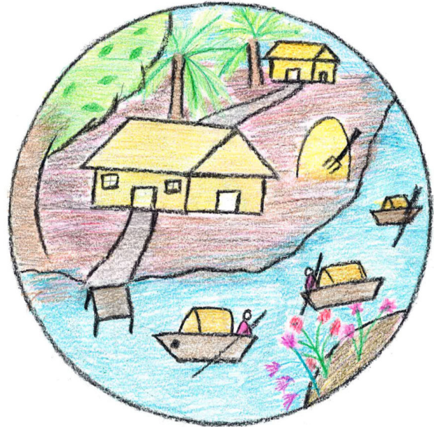
Figure 8. Travelling home

“Similar to my stress mandala, my coping mandala (see Figure 10) has a dual swirl depicting my perception of reality and my mental state. Using the same color symbolism, the mandala swirls have alternating segments to show the effects of my coping attempts. My coping mandala begins on the outside with dark red and black-blue to show my grim perception of reality, and my despaired mental state, respectively. The swirl has segments of lighter colors depicting the stress-alleviating effects of my coping mechanisms such as visiting doctors, using distraction, and seeking social support. Similar to my stress mandala, the pink and blue colors demonstrate a positive perception and a peaceful mindset,