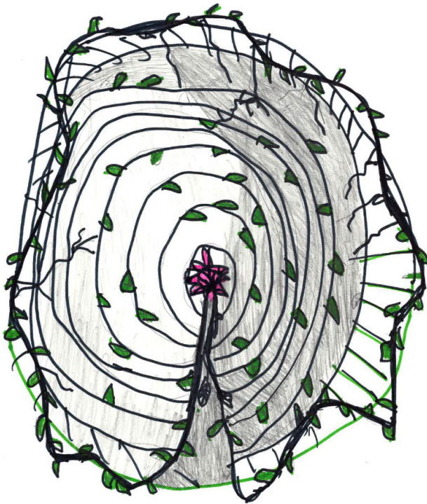
Figure 1. The breaking point

“I felt stressed and anxious as I cautiously waited for the thin veil of peace that remained to finally come undone as tensions rose in my home. I also felt a sense of imbalance, unsure of whether confrontation or dismissal would be the route used to find a resolution. Along with the sense of imbalance came an uncertainty which fueled my stress. My mandala (see Figure 1) is an expression of the emotions I experienced as the tension climaxed. A pink flower, at the centre of my mandala, represents the calm I struggled to hold onto as the stress of the situation heightened. Around the flower, I drew vines in a spiral shape to display the slow but dedicated progression of events which led me to feel a lack of control as the tension reached a breaking point. The vines in my mandala wind into the centre, almost reaching into the flower as if to hold it captive; this part signifies the peace being abruptly taken away. I felt trapped, powerless, and helpless. I wanted to know the right words to say to de-escalate the tension, but I could not find them. I am used to being level-headed, able to solve the problem, but in this case, I saw no solution. I yearned for peace to return and balance to be restored.”