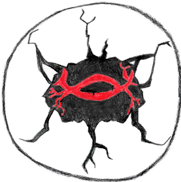
Figure 3. A breakdown

represent my experience of a 'breakdown'. Similar to cracking pavement, my internal integrity was no longer whole as I was experiencing exceptional disruption of my physical, emotional, and psychological well-being. The black color utilized in the cracks represents the lonely isolation I experienced during my time of stress. The experience of isolation did not occur due to the lack of human interaction, rather, isolation manifested because I experienced my stress in complete silence without recognition from others. The red, gorging blood vessels in my mandala adds a humanistic aspect to my experience of stress as I, a human being with emotions and sensations, endured the suffering; this also symbolically represents the activation of the sympathetic nervous system that occurs with stress. The black cracks in conjunction with the red blood vessels depicted my experience as my stress began to break my body down in remote isolation."