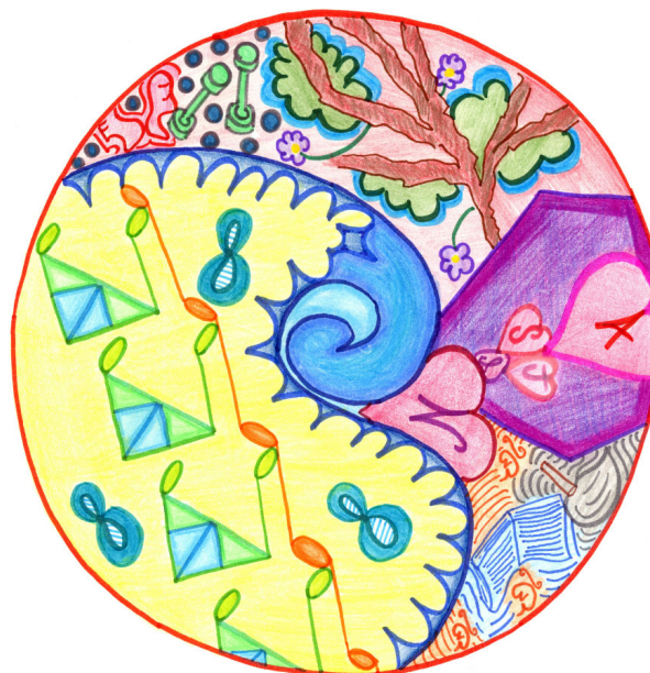
Figure 6. Support systems

desire for a visit to my hometown and my family so that my ongoing loneliness can be relieved. However, since travelling is not feasible during the school year, such desire becomes a constant stress that greatly affects my life. As illustrated in my mandala, even though my living environment is bright and vibrant like the red color in the background, everything in front of me appears to be coated with a sorrowful dark grey color.”