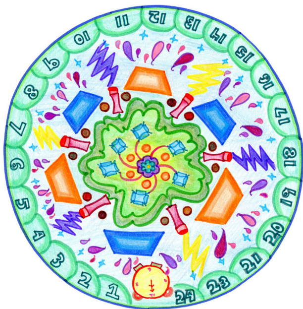
Figure 5. A driving force

and its symbolism of water to be calming. The other side of my mandala is covered with colorful musical notes because I often turn on music to cope, which uplifts my confidence and puts me in a cheerful mood. The five hearts represent each of my family members with whom I possess a close relationship. The lighter colors represent my younger family members because they remind me of my childhood and allow me to relive those memories. The larger and darker hearts represent my parents who guide me using their extensive personal experiences. The top corner of my mandala includes symbols that represent the value that I have for my culture and spirituality. I believe in God and praying helps me to cope because it brings peace to my mind and acts as a stress reliever. The bottom of my mandala encompasses nature and gym equipment/attire because working out, playing sports, and taking walks allow me to physically and mentally relax. As represented in my mandala, I use a positive approach to cope with stress and I have several internal and external support systems.”