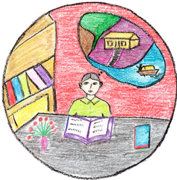
Figure 7. Isolation

respectively. As my medical ordeal resolved with no life-limiting illness, the mandala swirls into a bright core with a pink heart to demonstrate the positivity and importance of social support in my experience of coping.”