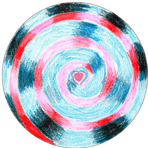
Figure 10. Coping