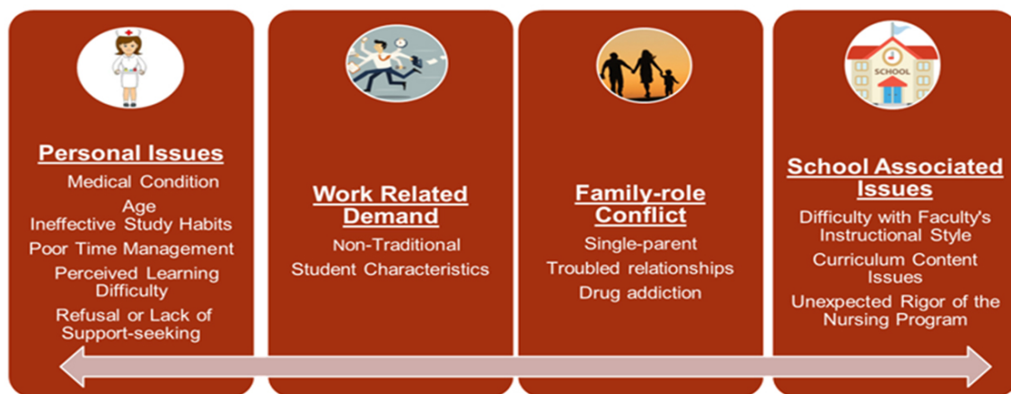
Figure 1. Perceived Factors that contributed to the period of temporary

the four axial themes resulting from the interviews.