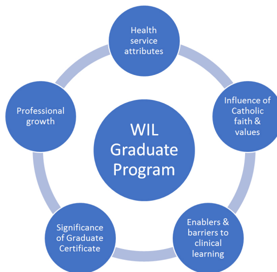
Figure 3. Qualitative Research Findings

[The health service] has been wonderful and supportive and utilizes their values and mission statement.