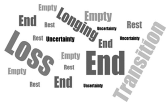
Figure 2. Word cloud of death-meanings.

The results about meaning of death and feeling of loss, are presented in the form of word clouds. Figure 2 shows the different meanings of death identified by the students. The words that came up the most to represent the meaning of death were end, loss, and emptiness.