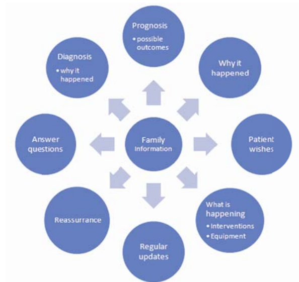
Figure 2. Conceptual map of family information: Nurses