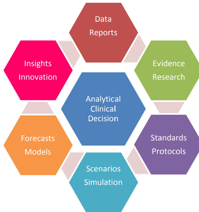
Figure 1. Analytical clinical decision framework

Analytics provide the interprofessional team with the tools needed to assess what is working and what is not, manage risk, and examine health care decisions. Thus, it promotes the coordination of patient care, reduces excessive avoidable costs, and provides accurate and reliable information at the point of care where decisions are made.