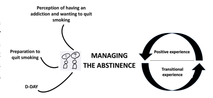
Figure 2. Controlling the urge to smoke as a central process in smoking cessation

a sense that abstinence "can be maintained" in everyday life. Finally, the process of smoking cessation advances when the individual feels that he or she is in control of the urge to smoke and expects to continue to be in control.