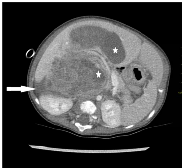
Figure 1. Pre-operative abdominal computed tomography scan showing necrotic areas (stars) and free fluid (arrow).

One month after stopping therapy the patient presented with dyspnea. CT showed multiple extra-hepatic (intra-abdominal) and lung metastases. Rescue chemotherapy was administered with no response and the patient died of progressive disease one month after recurrence.