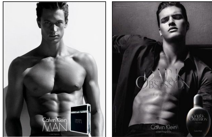
Figure 3. Experimental condition C-sexual appeals with naked body