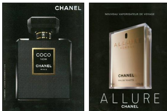
Figure 1. Experimental condition A-vanity appeals with brand name

The present study adopted a 3 \times 2 between-subjects experimental method to operate the two independent variables, namely advertising appeal types (vanity, admiration, and sexual) and consumer product involvement (high and low-involvement). To select a brand of male perfume and endorser fit for the present study, five famous brands (Boss, Bulgari, Chanel, Mont Blanc, and Calvin Klein) and five famous endorsers (Brad Pitt, Robert Pattinson, Ryan Reynolds, David Beckham, and Johnny Depp) were selected for a pretest of advertisement stimuli. The pretest results revealed that the brands with the highest brand awareness in Taiwan were Calvin Klein (34.6%) and Chanel (33%), whereas the most popular endorser in Taiwan was David Beckham (45.2%). Subsequently, three experimental scenarios were developed based on the pretest results (Figures 1-3).