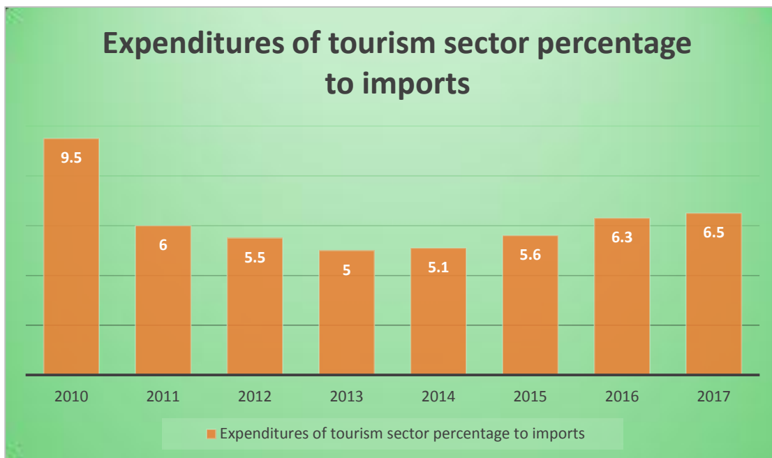
Figure 3. Expenditures of tourism sector percentage to imports in Jordan by depending on annual statistics for the period 2010 to 2017