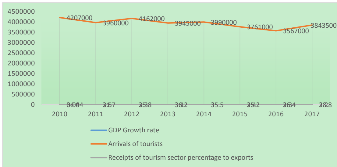
Figure 5. Receipts of tourism sector percentage to exports, Arrivals of tourists and GDP Growth rate in Jordan by depending on annual statistics for the period 2010 to 2017

The following figure represents the impact of the development of tourism sector on GDP growth rate in Jordan by depending on annual statistics for the period 2010 to 2017as follows: