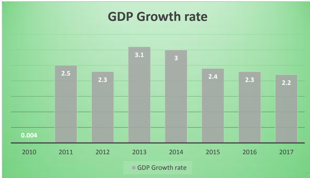
Figure 4. GDP Growth rate in Jordan by depending on annual statistics for the period 2010 to 2017