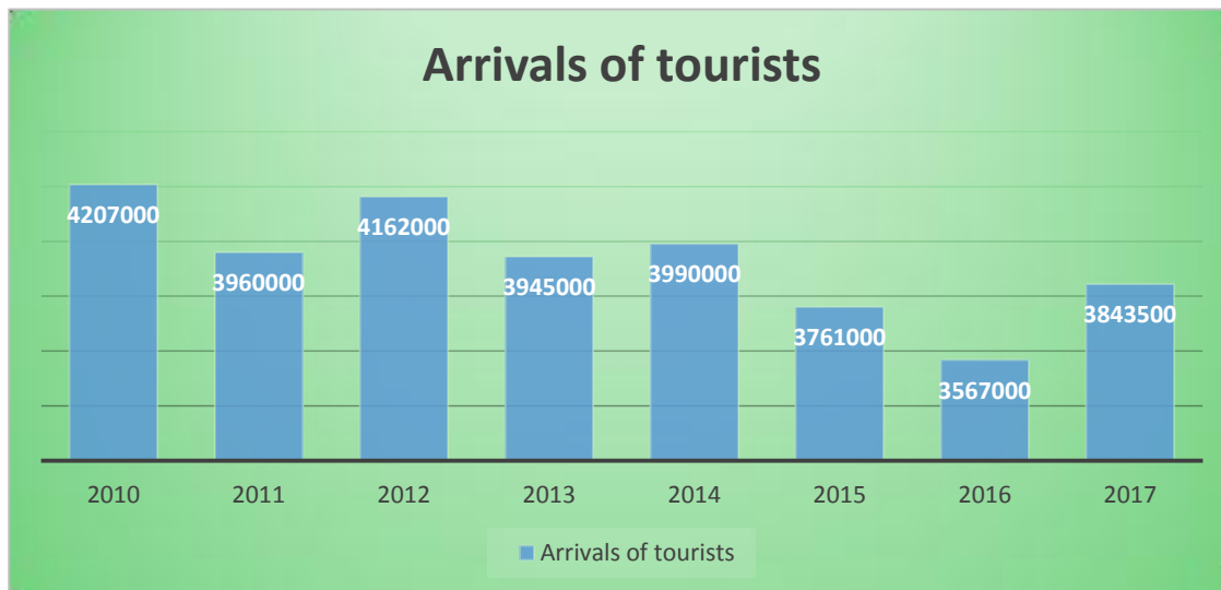
Figure 1. Arrivals of tourists in Jordan by depending on annual statistics for the period 2010 to 2017