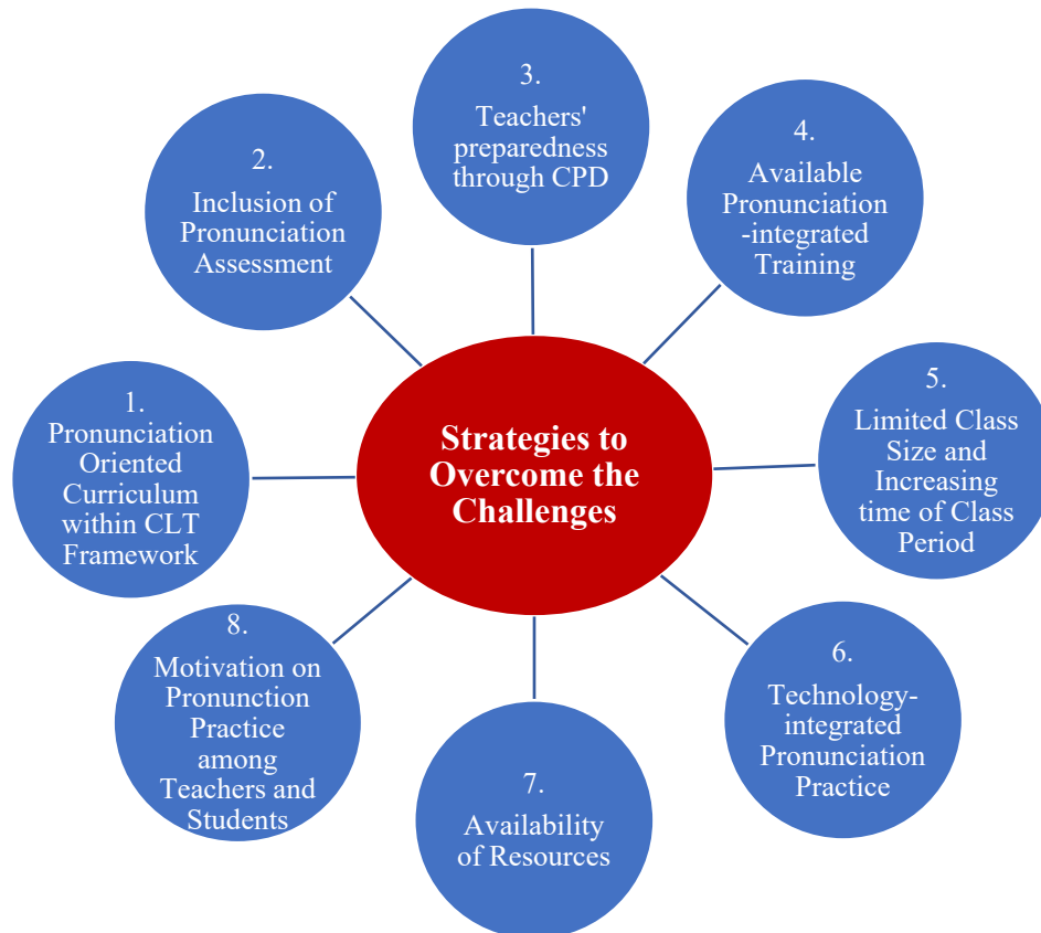
Figure 3. Strategies to Overcome the Challenges of ESL Pronunciation in Bangladesh

The diagram below presents various strategies to overcome challenges in teaching English as a Second Language (ESL) pronunciation in Bangladesh. Here is an explanation of each strategy: