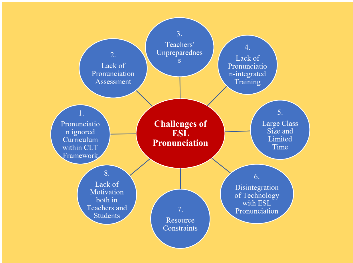
Figure 2. Challenges of ESL Pronunciation in Bangladesh

The diagram below highlights key challenges in teaching English as a Second Language (ESL) pronunciation in Bangladesh. Here is an explanation of each challenge: