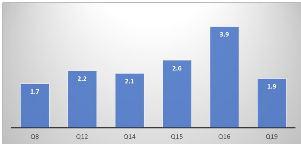
Figure 3. students' feeling about using GD to generat, revise and edit ideas

The third research question's findings revealed that students showed little enthusiasm for sharing their written work with peers and participating in mutual feedback exchanges. Despite the observed benefits of autonomous collaborative writing in facilitating idea