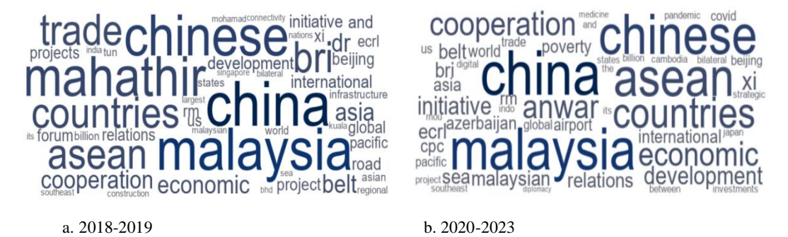
Figure 2. The Topics on BRI Concerned by New Straits Times from 2018 to 2023

Thematic terms with a high frequency can visually present the discourse focus and issues of concern emphasised by NST on the BRI. Firstly, this study compares the two target corpora, NSTC-A and NSTC-B, with the reference corpus, BPRC, and selects the top 50 thematic terms according to the keyness value (see Figure 2). The font size of the thematic term represents its keyness value: the larger the font size, the higher the significance—this indicates that the word is highly representative of the characteristic vocabulary of the two self-built corpora. This step can provide a clear picture of what topics on the BRI the New Straits Times are interested in.